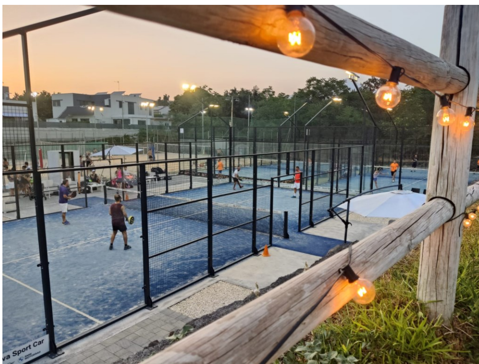
Figure 3. Kajoka Padel club in Gravina of Catania in the province of Catania, Sicily, Italy.

As highlighted in Figure 2, the provinces of the island with the most padel clubs are Catania (31 structures), Palermo (22s), Syracuse (22s), and Messina (18s). Overall, all the Sicilian provinces are interested in increasing their number of fields and practitioners. Compared to 321 FITP-affiliated fields present in Sicily as of 31 October 2022, Catania and Palermo are in the national top ten for the number of fields per province (with Rome in the lead, followed by Milan and Latina) ( www.federtennis.it ). The average number of fields per facility is in line with the Italian one, i.e., just over 2 fields per club; at the same time, there are 14 clubs with at least 4 courts, of which 6 have at least 6. The top 8 clubs for the number of courts are located in the provinces of Catania (Figure 3) and Palermo. However, this year, several inaugurations of other larger structures are scheduled in the other Sicilian provinces.