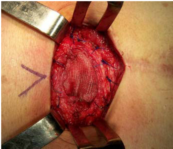
Figure 2 Epigastric Incisional hernias