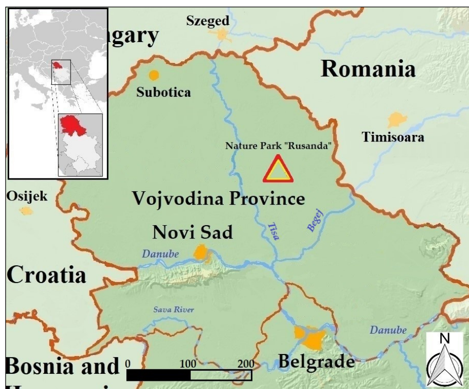
Figure 1. Location of the NPR.

Rusanda SPA is an important part of this protected area and it is an active spa resort. It is located on the northern shore of the lake with the same name in the settlement of Melenci in the municipality of Zrenjanin. Ever since its establishment in 1867, it has had a healing tradition based on the use of healing properties of mineral mud and water from the salt lake of Rusanda, which is considered one of the best healing spas in the country. This is the largest salt lake in the Carpathian basin [61]. Thermo-mineral water from Lake Rusanda has a curative effect on rheumatic fever, degenerative rheumatism, consequences of trauma, and certain gynecological as well as some other diseases [62]. The spa complex is located inside a park made up of trees hundreds of years old, with an area of four hectares, and is the only wooded area in this part of Vojvodina [1].