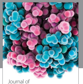
Journal of Diabetes Research