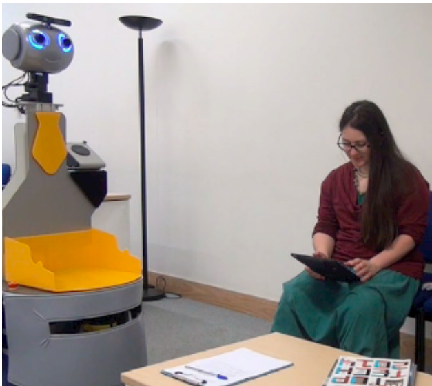
Figure 1: A participant and the robot in the experimental setup.

sented based on how useful and informative people found it and whether it met their expectations for the interaction. People preferred information about the time remaining until a task is complete, which supports our hypothesis that users want information that directly affects them and also does not burden them with the details of how a service is performed. While the participants in this exploratory experiment were not elderly, related literature studying task interruptions found that elderly and non-elderly participants have similar responses. We also intend to validate these results through further experimentation with elderly participants. Evaluating the quality of interaction between elderly people and service robots in realistic scenarios and environments is a key goal of the ROBOT-ERA project, and focussed laboratory experiments such as this one help to inform the design of the system. Finally, we discuss how future work on more sophisticated integration between a dialog system and planner could enable non-expert users to help to modify or repair plans according to their preferences when task execution fails.