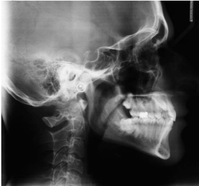
Figure 2. Lateral cephalometric radiograph from a patient with palatally displaced canines. A complete calcification of the atlanto-occipital ligament or ponticulus posticus can be appreciated.