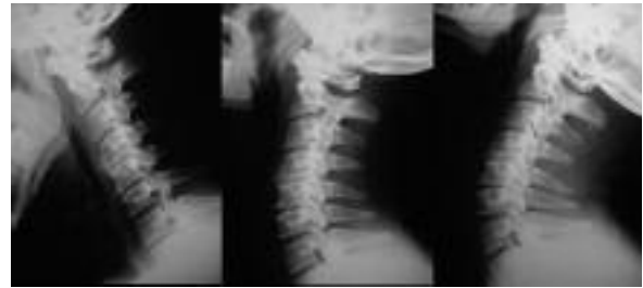
Figure 2. Preoperative (2005) cervical x-rays with flexion ( left ), neutral ( middle ) and extension ( right ) views showing a reduced disc height at C4/C5, along with a kyphotic angulation, with increased interspinous process distance, and absence of angular movement at the same level.

in the hands. A rapid progression of sensory disturbances to the lower limbs associated with severe walking disturbances prompted his admission for further treatment.