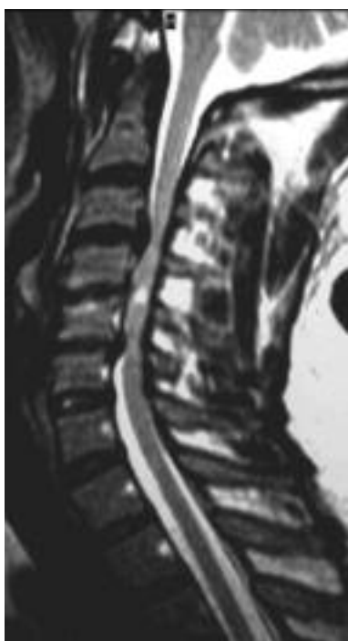
Figure 3. Magnetic Resonance imaging performed ten years later, in 2005. T2-weighted sagittal image showing a large disc herniation at C3/C4 causing spinal cord compression and a smaller disc herniation indenting the spinal cord at C5/C6. High signal changes are seen within the spinal cord at C4/C5.

Due to the large disc hernia causing severe spinal cord compression at C3/C4, we decided to treat this level first in order to prevent possible neurological worsening secondary to further spinal cord compression during surgical maneuvers at C5/C6. After opening the posterior longitudinal ligament and decompressing neural structures, two 5 mm high ProDisc-C were implanted at C3/C4 and C5/C6, respectively. At C3/C4 we used the prosthesis with the widest footprint we could implant without drilling the uncinata processes, given the absence of uncoarthrosis and foraminal stenosis. This prevented the use of a deeper device, which would have been associated also with increased width, according to the ProDisc-C sizes.