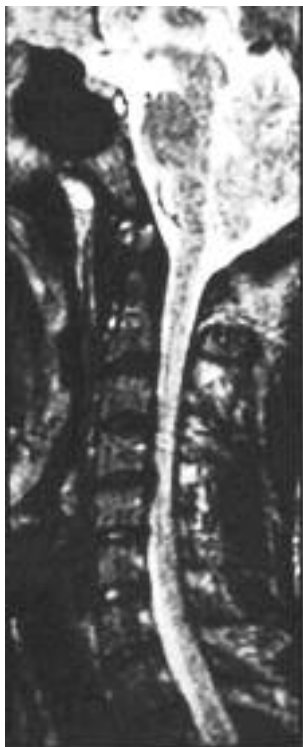
Figure 1. Preoperative (1995), T2-weighted, sagittal magnetic resonance image showing both a large disc herniation at C4/C5 causing spinal cord compression and signs of degenerative disc disease at C3/C4 and, to a lesser extent, at C5/C6.

Ten years later, he returned back complaining of neck pain, recurrent paresthesiae and numbness in both upper limbs along with clumsiness