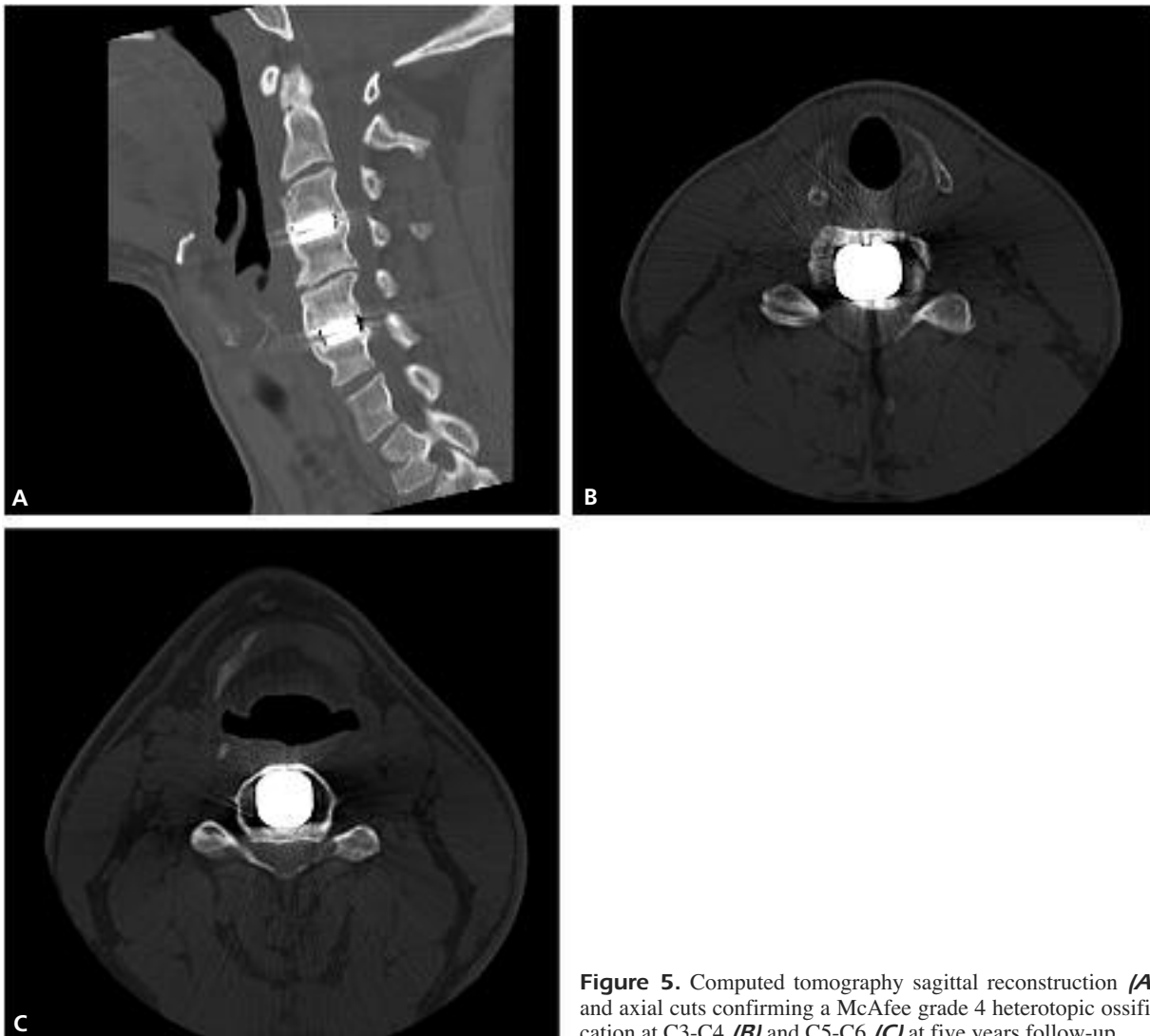
Figure 5. Computed tomography sagittal reconstruction ( A ) and axial cuts confirming a McAfee grade 4 heterotopic ossification at C3-C4 ( B ) and C5-C6 ( C ) at five years follow-up.

Several studies 11,17,24,56-60 on different disc prostheses have documented a satisfactory short- and intermediate-term outcome, and rare complications have been reported 61 . HO is a known phenomenon, whose causes remain unexplained 62-64 and incidence highly variable 65,66 . Patient-related conditions 64 , unnatural segmental motion after prosthesis's implantation 62 , bone morphogenetic proteins released from normal bone in response to abnormal conditions like trauma, inflammation or disease of connective tissue attachments