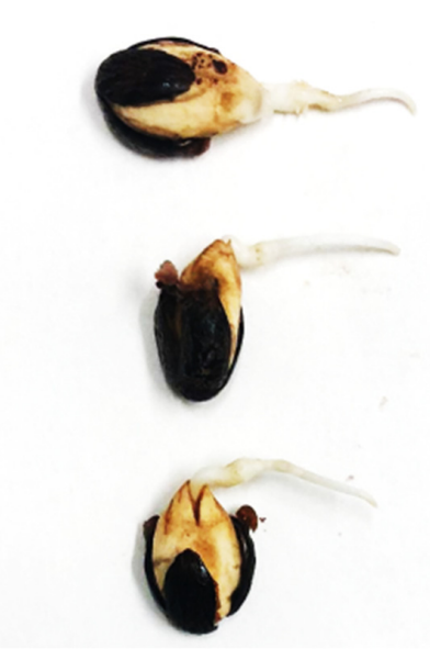
Figure 1. Germination of castor seeds, photographed on the fourth day from the recorded start of germination using an iPhone X smartphone.

The length of the radicle was measured in seeds of all genotypes at all temperatures. For this purpose, five seeds per replicate were randomly chosen from those first germinated, on the fourth day from the recorded start of germination (i.e., first radicle appearance) (Figure 1). In the case of germination being lower than 5 seeds, only those germinated were measured. Seeds were then photographed to document the radicle length at different temperatures.