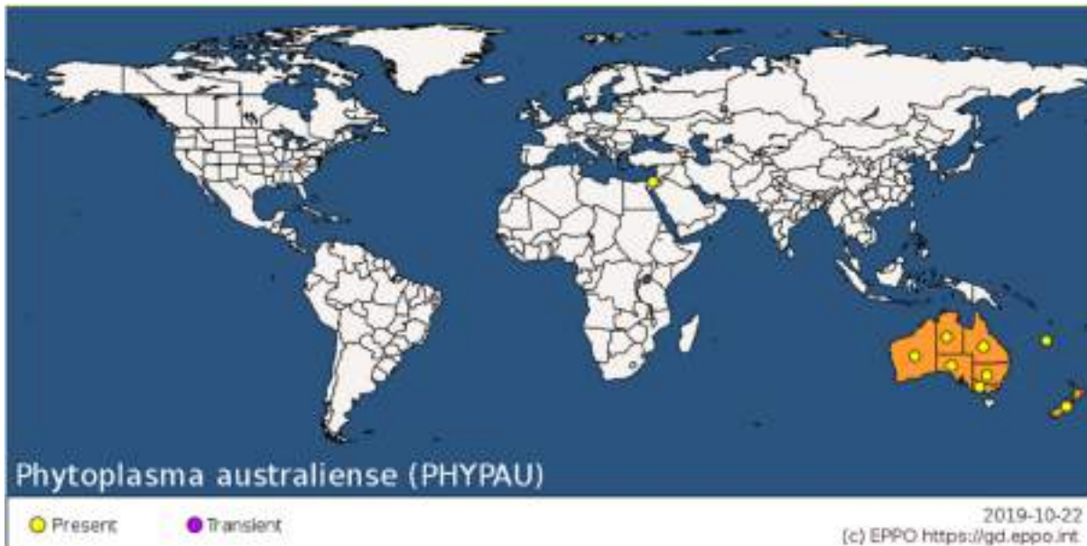
Figure B.1: EPPO distribution map for ' Candidatus Phytoplasma australiense'

The available distribution maps of the non-EU phytoplasmas of the host plants (Source: EPPO, 2019) are provided in Figures B.1–B.3.