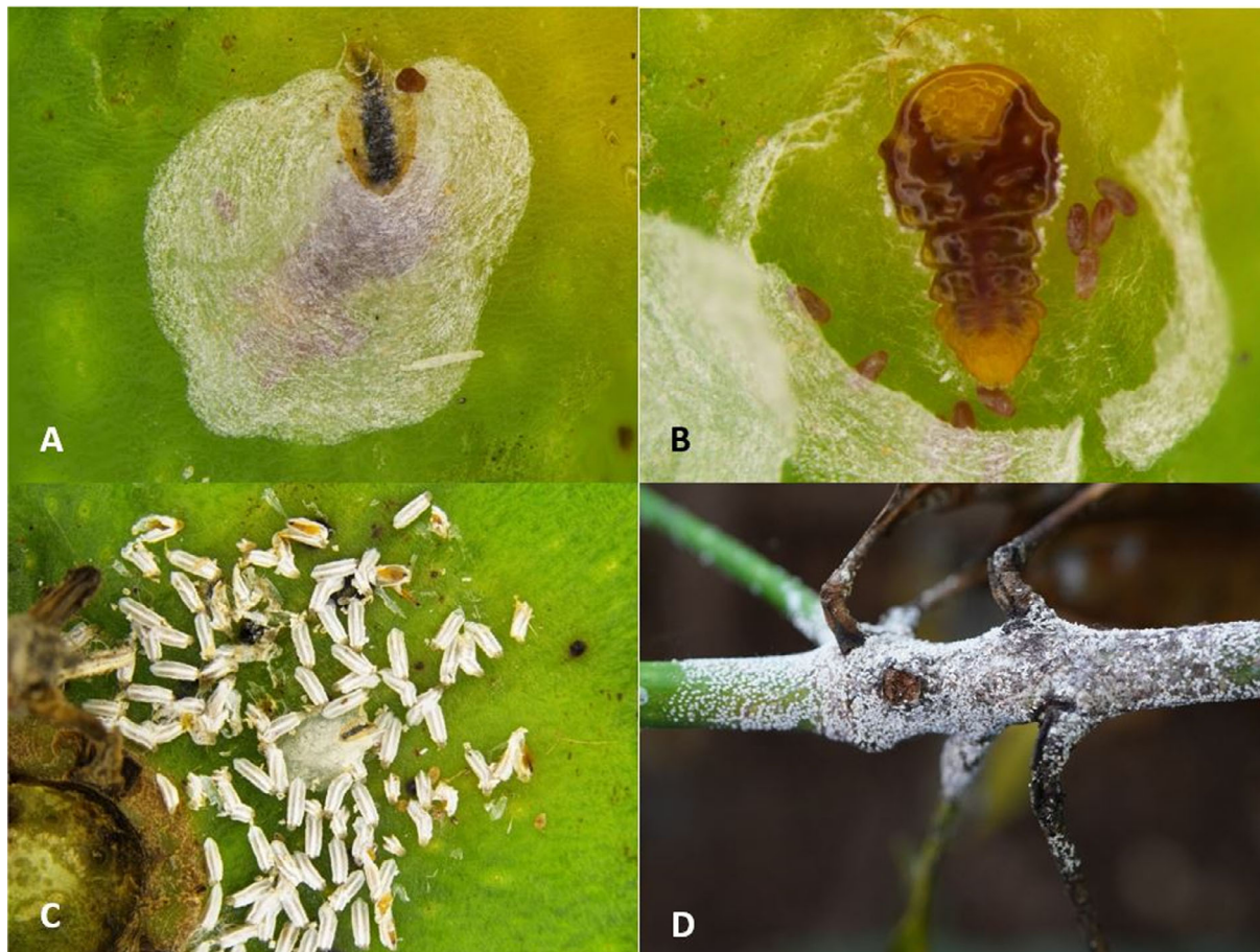
Figure 1: Aulacaspis tubercularis : A, adult female scale cover, diameter 2.0 mm; B, scale cover removed to reveal body of adult female and purple eggs; C, immature male tests, length 0.6 mm; D, mango shoot exhibiting necrosis due to heavy infestation of scale in the Caribbean

Important features of the life history strategy of A. tubercularis are summarised in Table 2.