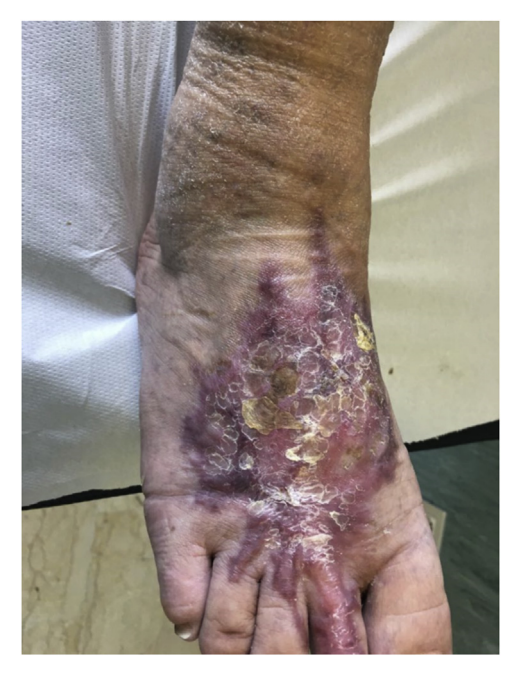
Fig. 1. Skin ulcer on the right foot before therapy administration.

examination was inconclusive, showing neither necrotizing granulomatous inflammation nor multinucleate giant cells.