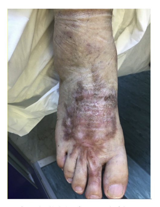
Fig. 2. The skin lesion after 12 month of therapy.

Nevertheless, a slice of cutaneous tissue was deparaffinised and analysed with RT-PCR amplification using primers specific for IS6110 and mpb64 of M tuberculosis , and 16S rRNA gene of NTM (Anyplex plus MTB/NTM detection, Seegene). The result was positive only for NTM, identifying a M intracellulare strain. Bacterial and fungal cultures were negative, while a Löwenstein-Jensen medium culture resulted positive after 25 days of incubation. Pigmentation production testing showed a non-chromogenic mycobacterium (Runyon III group). In vitro susceptibility testing showed that the isolated mycobacterium was sensitive to clarithromycin, rifampin and ethambutol. In accordance to the