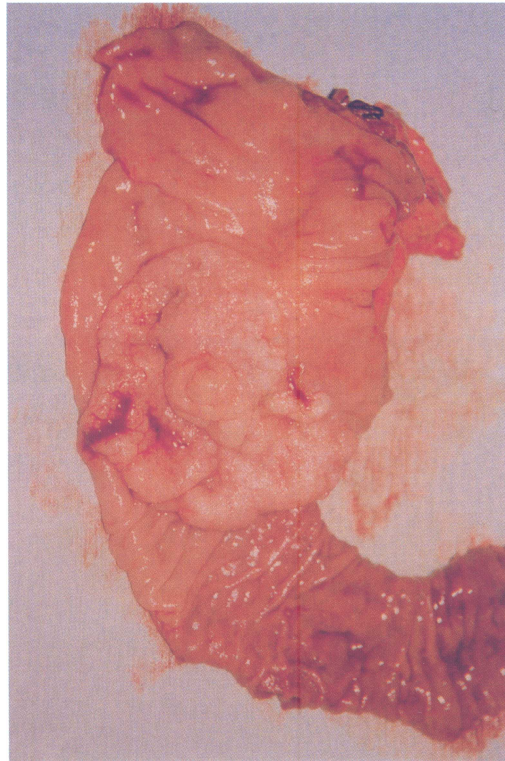
Figure 2 Pancreaticoduodenectomy: operative specimen showed a plaque lesion with villi invading circumferentially the pancreatic duct and the common bile duct at the papilla. See Color Plate II.