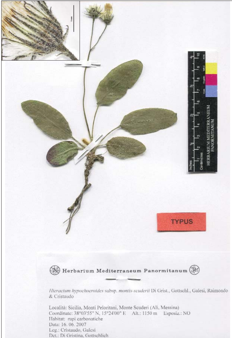
Fig. 2. Hieracium hypochoeroides subsp. montis-scuderii : Holotype.