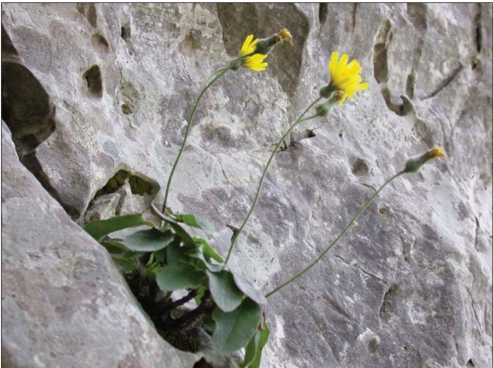
Fig. 3. Hieracium hypochoeroides subsp. montis-scuderii : blooming individuals in nature.

PHENOLOGY. – Flowering time: June (Fig. 3). Fruiting time: June to first decade of July.