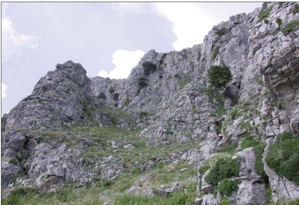
Fig. 4. Carbonate cliffs of Monte Scuderi: the locus classicus of Hieracium hypochoeroides subsp. montis-scuderii .

TAXONOMIC RELATIONSHIPS. – Because of the ramification of the synflorescence the new taxon clearly belongs to Hieracium sect. Bifida , which includes the two collective species H. bifidum and H. hypochoeroides , each with numerous apomictic subspecies or