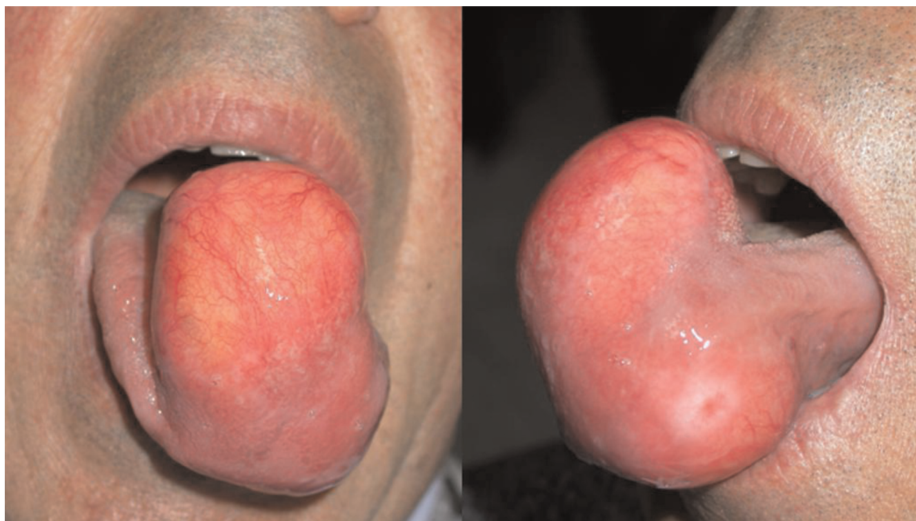
Figure 1. Clinical examination showing a giant, yellowish, submucosal mass involving tongue.

a high density, consistent with lipomatous tissue. The diagnosis of lipoma was proposed, accordingly. A transoral V-shaped surgical excision was performed under loco-regional anesthesia. Sutures were removed on the 10 th postoperative day. The specimens were fixed in 10% buffered formalin, and embedded in paraffin for routine histological examination.