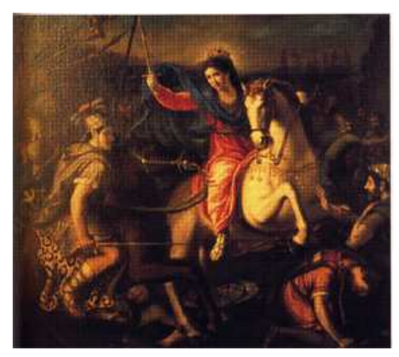
F. Pascucci, The Madonna of "Milizie", 1780 (Scicli, Church of "Collegio").