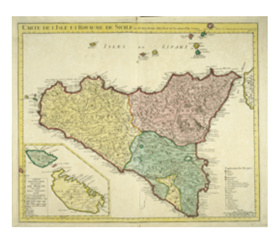
G. Delisle, Carte de l'Isle et Royaume de Sicile, Paris 1717