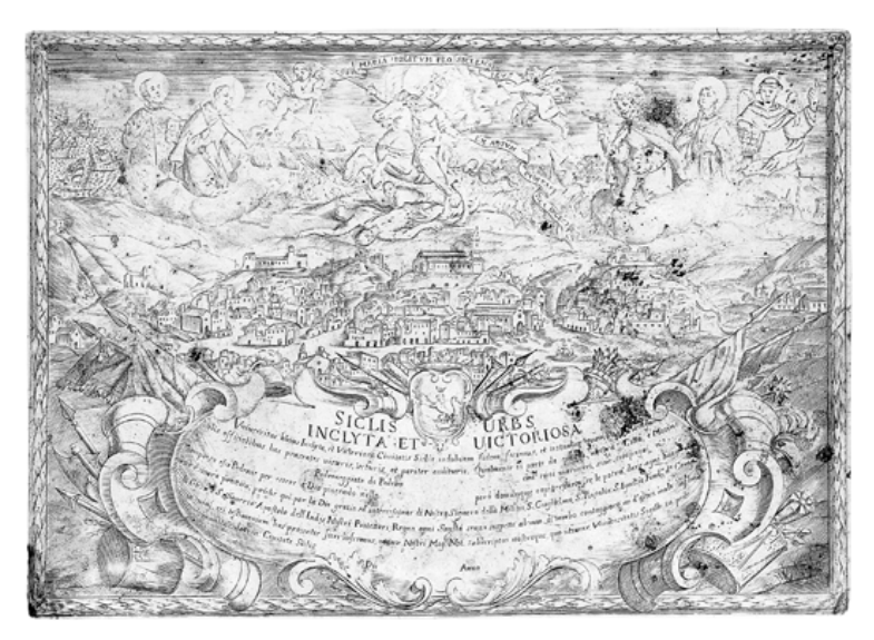
[Patente sanitaria marittima di Scicli (Licence of good health)], seventeenth century

It was the Patente sanitaria marittima issued by the University of Scicli in the first half of the eighteenth century. The perspective of the view is almost identical to that of a previous drawing, but the representation criteria changes.