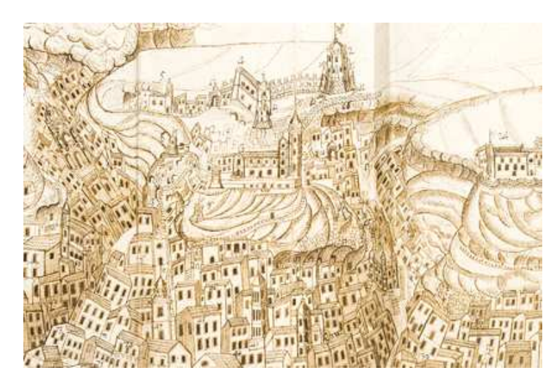
View of the city of Scicli, cm 57x91, XVIII century. (Biblioteche Riunite "Civica e Ursino Recupero" – Catania)

Religious but also political conflicts were frequent among the members of the various parishes: not only between the supporters of the two churches (San Matteo over the hill and Santa Maria La Piazza under the hill), but also among supporters of other churches. For example, there were frequent contrasts between the church in the right canyon and the one on the left side of Colle San Matteo. Because of these contrasts, the urban space was deeply contended. Changing the procession route or moving the boundary of a parish was enough to cause tension and strife (and sometimes even murders) among the inhabitants.