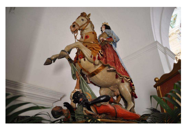
Madonna of the "Milizie", XVIII century (Scicli, Church of St. Teresa)

All of which, besides being part of the already rich thread of post-Tridentine Marian cults, offered the opportunity to emphasize its military function of defence against the dangers coming from the sea to the city.