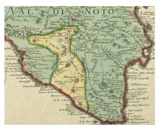
G. Delisle, Carte de l'Isle et Royaume de Sicile, Paris 1717. The County of Modica

In this period, the farthest south-eastern point of the island, which corresponded more or less to the County of Modica, played an important strategic role. An evidence of this is represented by a singular politico-diplomatic incident. In 1713, the year in which Sicily passed to Amadeus of Savoy with the Treaty of Utrecht, the king of Spain Philip V kept for himself full power over the County which thus became an authentic enclave within the Savoy rule<sup>7</sup>.