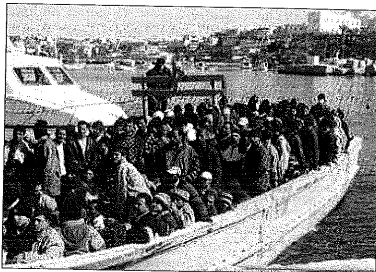
Photo 2: Landing of illegal immigrants on Lampedusa

uncertainty about their future; in despair and disappointment of all. 4 On 12 th August 2011 ASGI 5 spread throughout Italy a document denouncing the delays of the territorial commissions with regard to applications for asylum and stressed the urgency of closing the mines and the CARA Salina Grande in Trapani, reiterating the 'urgent need to rethink the national reception system.