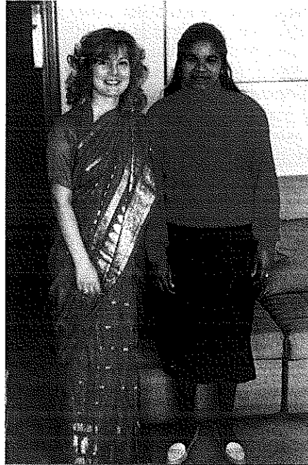
Photo 1: Example of integration and multiculturalism. Exchange of clothing between two ladies, a local one and a Mauritian one

foreign population (ISTAT, 2010), are highly concentrated (nearly 96%) in the provinces of Catania (2,480) and Palermo (1,159). After streaming into Sicily in the 70s, Catania was the most popular reception city, followed by Bari, Milan and Palermo. These towns have the most cleaning and maintenance positions. The successful integration of the Mauritian community is apparent by the many associations in the historical centre of Catania. The most important of these are the Al-Man Mauritian Association (with a predominance of Hindus and a small number of Catholics), the Catania Mauritian Association which Hindu-Tamils are related to, the "Geetanjali Circle" which also consists of Hindu Mauritians, l'Associazione Socio-Culturale Italo-Mauriziana , l'Association Des Immigrantes Mauriciens de la Province de Catane and the Italian Federation of Mauritian Associations (photo 1).