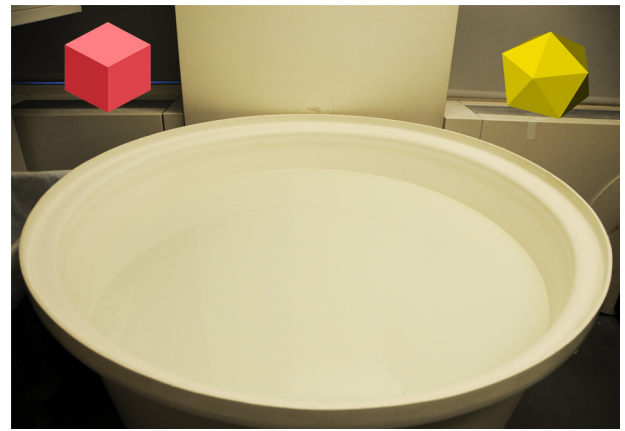
Fig. 3. Picture of the MWM apparatus used in our laboratories.

Briefly, the apparatus consists of: (i) a plastic large circular pool (height: 75–80 cm; diameter 150–200 cm for rats and 90–120 cm for mice) filled with water (up to about 40 cm below the edge to prevent the animal jumps out), maintained at about 25 °C and made opaque to hide the submerged platform, e.g., by the addition of nontoxic white paint, powdered milk or synthetic opacifiers; (ii) a submerged platform (1 cm under the surface of the water) measuring 10 cm × 10 cm, preferably made of Plexiglas, non visible to the swimming animal (hence the name “hidden test”); (iii) stationary geometric cues made by different objects usually placed on the 4 cardinal points of the maze (we have found this to be more efficacious) or on the walls of the room but visible by animals during swimming; it is important that cues are not moved during the test; (iv) a camera mounted on the ceiling and connected to a video tracking system and software for motion detection. If this system is based on the color difference between the maze and the animal, one should use a white animal on a black background or, in our case, a black mouse (e.g. of the common C57Bl/6 genetic background) in a white maze (see Fig. 3).