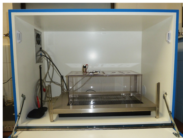
Fig. 1. Picture of the fear memory apparatus used in our laboratories.

Although several protocols have been proposed (see for example [137]), here we will describe a procedure that has been successfully used in our laboratories to investigate both contextual and cued conditioning in animal models of AD [33,34,138–144] (see Fig. 1 for a picture of the apparatus). Mice are tested individually in a conditioning chamber that is located in a sound-attenuating box with a clear Plexiglas window that allows video recording of the experiment. The conditioning chamber has a 36-bar insulated shock grid floor. The floor is removable, and after each experimental subject, it is cleaned with 75% ethanol and then again with water. To provide background white noise (72 dB), a single computer fan is installed in one side of the sound-attenuating chamber. Mice are handled once a day for 3 days before behavioral experiments. Only one animal at a time is present in the experimentation room. It is placed in the conditioning chamber for 2 min, following which a discrete tone (CS) at 2800 Hz and 85 dB is delivered for 30 s. In the last 2 s of the tone, the mouse receives a foot shock (US) through the bars of the floor (0.50–0.80 mA for 2 s). The experimenter might regulate the intensity of foot shock; for example it is possible to elicit stronger memory by using a 0.75 mA foot shock. After the CS/US pairing, the mice are left in the conditioning chamber for another 30 s and are then placed back in their home cages. Freezing behavior can be