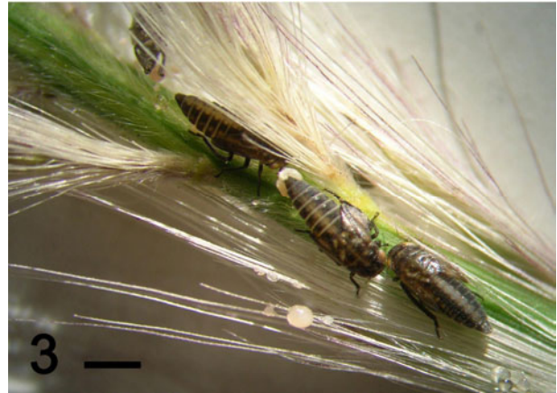
Figure 3. Mature nymphs of B. brevis . Scale bar = 1 mm. (In colour at www.bulletinofinsectology.org )

The adults length ranges 3.20-3.80 mm (males 3.20-3.53 mm; females 3.33-3.80 mm). Colour greenish-yellow. Scutellum with a longitudinal crimson strip and blackish spot near the posterior extremity. Wings hyaline (figure 2). Mature nymphs brownish with a dorsal medial longitudinal whitish streak along the body especially evident on the abdomen (figure 3). To identify the