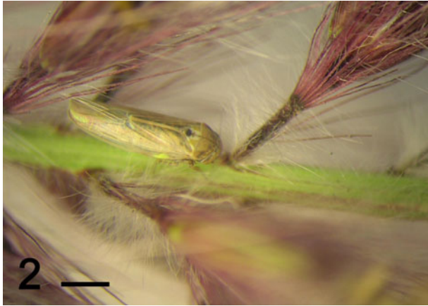
Figure 2. Adult of B. brevis . Scale bar = 1 mm. (In colour at www.bulletinofinsectology.org )

of B. rosea (Scott 1876)], B. nicolasi (Lethierry 1876), B. punctata (F. 1775) and B. saltuella (Kirschbaum 1868), while there is some doubt about the report of B. tricolor (Gmelin 1790) (D'Urso, 1995; Guglielmino et al. , 2000; 2005).