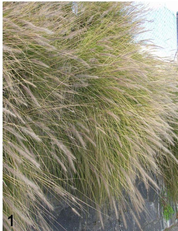
Figure 1. P. setaceum (Catania city). (In colour at www.bulletinofinsectology.org )

A recent survey on the insect pests of ornamental plants, in various Sicilian cities, led us to discover associated with P. setaceum the leafhopper Balclutha brevis Lindberg (Rhynchota Cicadellidae) (figure 2). This is the first record of this species among the Italian fauna in the Mediterranean basin. Further studies on the bioecology and morphology of this species are in progress and will be the topic of another paper.