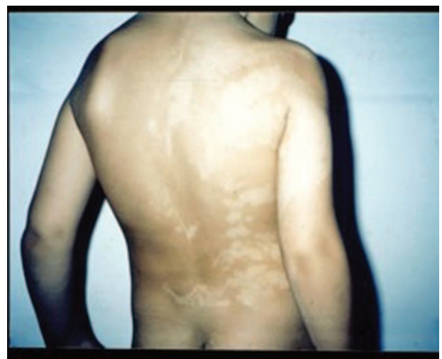
FIGURE 3. Patient 7 at age 10 years: note the hypopigmented patches in the right area of the back and the ipsilateral kyphoscoliosis.

Pigmentary mosaicism along the lines of Blaschko ( of the Ito type ) still represents a challenging disorder for clinicians and a controversial issue in the medical literature. Even though Ito, in his original report, 18 described the skin anomaly as a purely cutaneous trait, subsequent case reports and case series expanded both the skin phenotype including scalp abnormalities, unilateral or bilateral curly hair, and conical teeth, 1-8 and the systemic phenotype reporting extracutaneous abnormalities (mostly of the musculoskeletal and nervous systems). 5,6,8,11-16