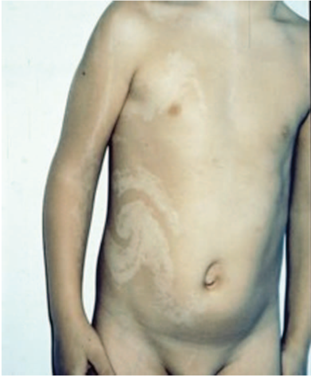
FIGURE 4. Patient 8 at age 9 years: note the hypopigmented whorls over the right side of the thorax and the abdomen and the linear hypopigmentation in the right arm.

The differential diagnosis comprises (other) disorders with hypopigmentation following the lines of Blaschko, 6–8 and thus include the atrophic/hypopigmented (fourth) stage manifestations of incontinentia pigmenti (IP) of the Bloch-Sulzberger type (MIM # 308310) (as stated above, pigmentary mosaicism along the lines of Blaschko is still categorized in the OMIM database as “ incontinentia pigmenti achromians ”, ie, as the hypopigmented counterpart—achromians—of incontinentia pigmenti ); focal dermal hypoplasia or Goltz Syndrome (MIM # 305600); and the systemic form of nevus depigmentosus (ND). 6,10 In the present patients, the diagnosis of IP was excluded since the hypopigmented lesions, which usually appear on the extremities, are preceded by a progressive (multi-stage) pattern of cutaneous lesions (ie, erythematous/vescicobullous [stage 1], pustular/verrucous [stage 2], and hyperpigmented [stage 3]). Goltz syndrome diagnosis was excluded by the absence of other cutaneous findings, such as linear areas of telangiectasias, hyperpigmentation and dermal atrophy, and focal alopecia and nail dystrophy: these signs were not present in our patients. The systemic form of ND in its unilateral form may be difficult to differentiate from pigmentary mosaicism, but it is usually not associated with systemic manifestations.