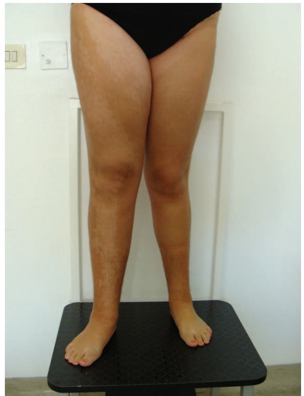
FIGURE 1. Patient 4 at age 15 years: note the right lower limb overgrowth in the affected limb with hypopigmentation.