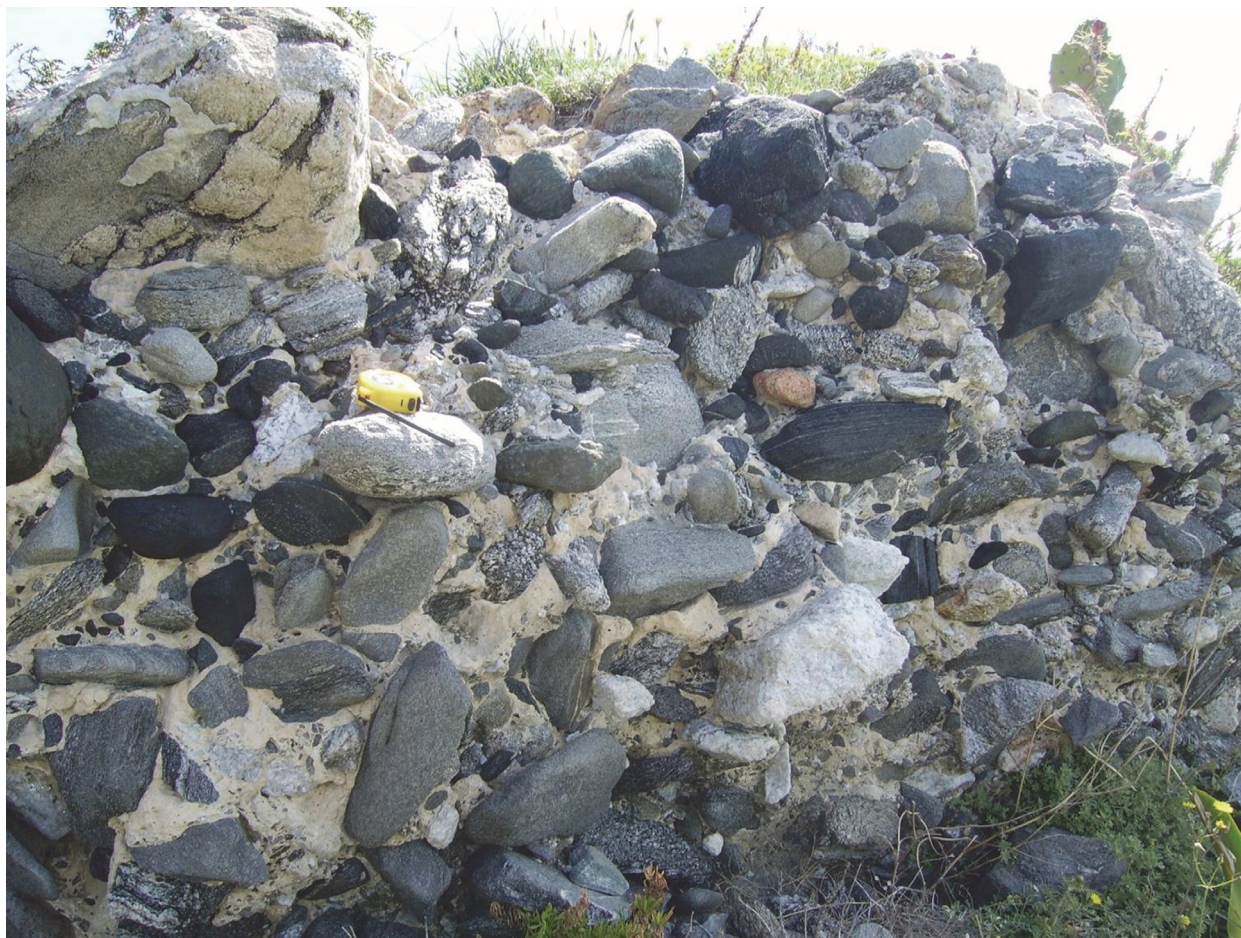
FIGURE 3. The Tortonian conglomerate formed as a result of the fragmentation of the underlying metamorphic rocks of the “Calabride Complex.”

Nemoceratina (Pariceratina) barrieri n. sp. Figure 4.1-12