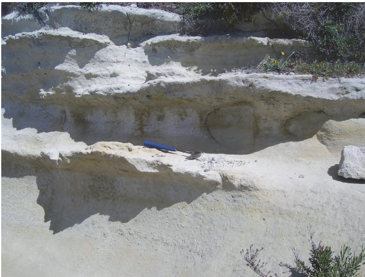
FIGURE 2. The yellow Gelasian calcareous sandy-silts resting unconformably on the Tortonian conglomerate.

it. The sedimentary sequence is terminated by Aeolian volcanic ashes.