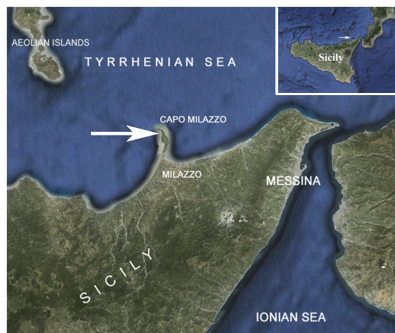
FIGURE 1. Geographical location of the Capo Milazzo Peninsula.

In the Cenozoic Pariceratina sp.1 are reported from Lower Miocene submarine cores in the West-