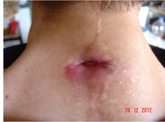
FIGURE 3: Significant reduction of the granuloma size after a thirty-day antibiotic treatment with amoxicillin/clavulanate and cotrimoxazole.

Several swabs were collected from the borders of the lesion as well as from the exudate, with isolation of C. macginleyi . Identification was performed by biochemical tests