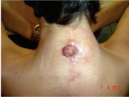
FIGURE 1: Formation of a round-shaped granuloma of about 2 centimetres along the surgical scar from a previous posterior spinal arthrodesis for kyphoscoliosis, in a patient with neurofibromatosis type 1. The granuloma evolved from a nodular lesion, which spontaneously drained, with purulent discharge and formation of a fistulous tract.