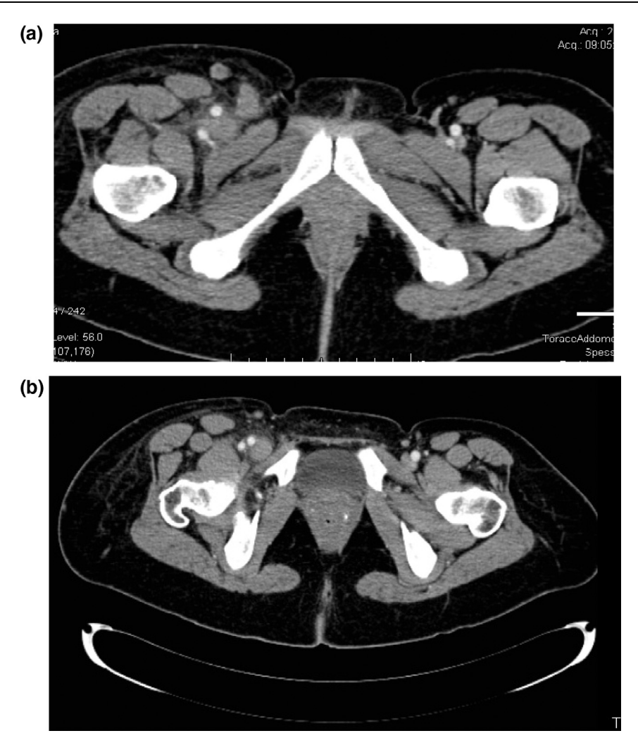
Fig. 2 (a) Mass of 22 mm irregular thickening, with spiculated margins, located in the subfascial of external oblique muscle. (b) DVT of iliac vein from extrinsic compression of the right vessels.

An uncommon localization of the disease, was observed in the external oblique muscle of patient described in this paper. Moreover, the patient developed a DVT of iliac vessel, which is a very rare complication associated with endometriosis. Likewise, the presentation of the condition was atypical with a sudden onset and without cyclical symptoms, that is unlikely for endometriosis. A similar case has not been previously reported. An extensive literature review of endometriosis involving striated muscles, was conducted addressing special attention to associated vascular complications. Finally, US had an essential role in detecting and localizing endometriosis, and providing in definitive histological diagnosis through ultrasound-guided biopsy.