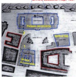
The project of Enna's Piazza del Governo, 1937