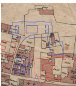
Enna's cadastral map, 1667