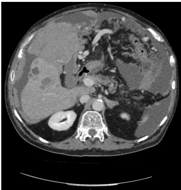
Fig. 2. A large mass involving the gallbladder and the anterior surface of the liver.

examination of the enucleated left eye showed a mixed-cell-type choroidal melanoma without intrascleral or vascular involvement. The size of the melanoma was 10 mm in thickness and 13 mm in diameter. Since then, the patient had been followed up regularly by an ophthalmologist. The last follow-up at 15 years after eye enucleation was negative for recurrence or metastatic diffusion. At the admission, laboratory tests were normal, except for increase CA-125 marker. Abdominal ultrasonography (US) and total body computed tomography (CT) scan were performed and revealed diffuse liver metastases in both lobes with a tendency to confluence, a large mass involving the gallbladder, associated with peritoneal carcinosis, bilateral adrenal metastases and a large mass in the left kidney (5 cm of diameter) compatible with another secondary localization (Figs. 1–3). EGDS and colonoscopy were performed in order to exclude other primitive malignant cancers. An ultrasound guided fine needle agobiopsy (FNA) of liver lesions was performed