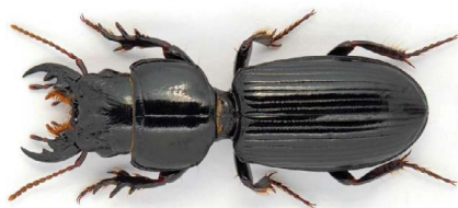
Figure 1: Parallelomorphus laevigatus .

Assessing the possible transfer of each metal through the food chain, we considered the metal burden in P. laevigatus (predator) and in its prey T. saltator . We can affirm that the concentration of As, Cr, Cu, Ni and Se in animal tissue differs in the beetles and in the sandhoppers according to their trophic role inside the ecological net. Differences in concentration for Cd, Co, Fe, Hg and V were correlated to both trophic level and sampling site, while Mn concentration differed among sites in a different way for the prey and predator. Moreover, the transfer trophic coefficient (TTC) (i.e., the ratio of the metal concentration in the beetles to that in their prey) is particularly high (approximately 5) for Hg.