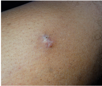
Fig. 1. Indurated, painful multinodular plaque located on the shin.

A 55-year-old Caucasian farmer presented with a 1-year history of a slowly enlarging nodule on his right leg. His family history and past medical history was unremarkable. The patient believed that the lesion had been caused by accidental penetration of a foreign body into the skin. At onset, the lesion was very small and painless, but later on its size increased and it became painful. Symptoms were unresponsive to non-steroidal anti-inflammatory drugs. At physical examination, a raised reddish, mobile multinodular plaque, with irregular borders, of about 1 cm in diameter, with a small crust surrounded by a whitish scale, was