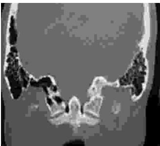
Figure 2: The C.A.T. on coronal scan highlights an air- harvest inside the spino-canal adjacent to the dens axis. Fusion of the right atlanto-occipitalis articular facet .