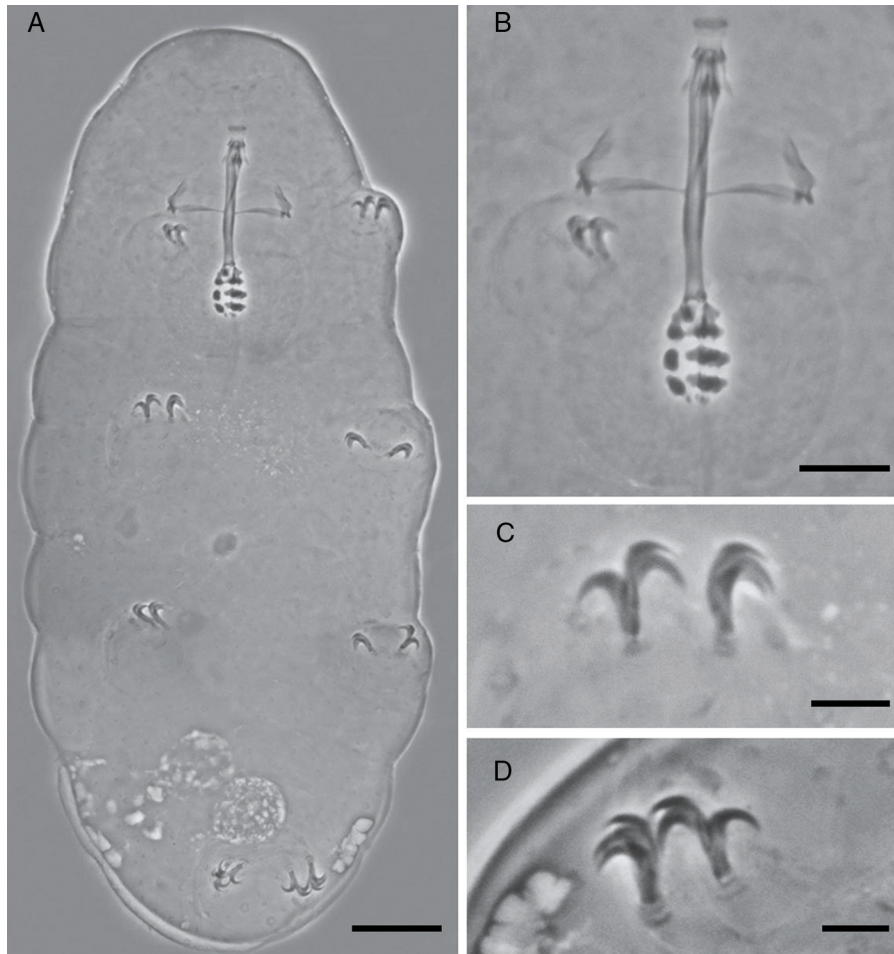
Figure 1. Holotype of Minibiotus pentannulatus sp. nov. (A) Habitus (scale bar 20 \mu\text{m} ). (B) Detail of the buccal tube (scale bar 10 \mu\text{m} ). (C) Detail of the claws of the second pair of legs (scale bar 5 \mu\text{m} ). (D) Detail of the claws of the fourth pair of legs (scale bar 5 \mu\text{m} ).

well-developed ventral lamina 13.1 \mu\text{m} [47.5]. Stylet support inserted on the buccal tube at 15.9 \mu\text{m} [57.6]. Rounded pharyngeal bulb 32.29 \mu\text{m} , with triangular apophyses close to the first row of macroplacoids. Three rows of macroplacoids decreasing in size, with granular appearance and a row of small microplacoids. First macroplacoid 3.0 \mu\text{m} [10.9], second macroplacoid 2.5 \mu\text{m} [9.1], third macroplacoid 2.1 \mu\text{m} [7.6]. Microplacoid, 0.9 \mu\text{m} [3.3]. Macroplacoid row is 8.0 \mu\text{m} [29.0], entire placoid row is 9.2 \mu\text{m} .