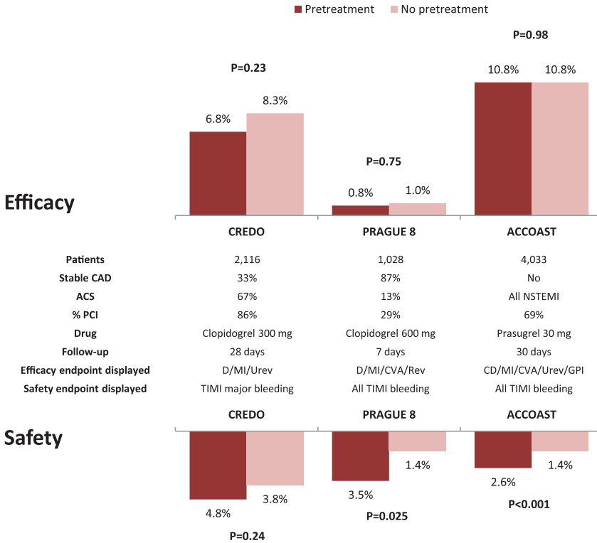
Figure 2. Studies of pretreatment in patients with stable coronary artery disease and non-ST-segment-elevation acute coronary syndromes (Clopidogrel for the Reduction of Events During Observation [CREDO], 34 Primary Angioplasty for Patients From General Non-PCI Hospitals Transferred to PCI Units With or Without Emergency Thrombolysis [PRAGUE-8], 35 and A Comparison of Prasugrel at the Time of Percutaneous Coronary Intervention or as Pretreatment at the Time of Diagnosis in Patients With Non-ST-Segment-Elevation Myocardial Infarction [ACCOAST] 22 ). ACS indicates acute coronary syndromes; CD, cardiovascular death; CVA, cerebrovascular accidents; D, death; GPI, glycoprotein IIb/IIIa inhibitors; MI, myocardial infarction; NSTEMI, non-ST-segment-elevation myocardial infarction; PCI, percutaneous coronary intervention; Rev, revascularization; and Urev, urgent revascularization.