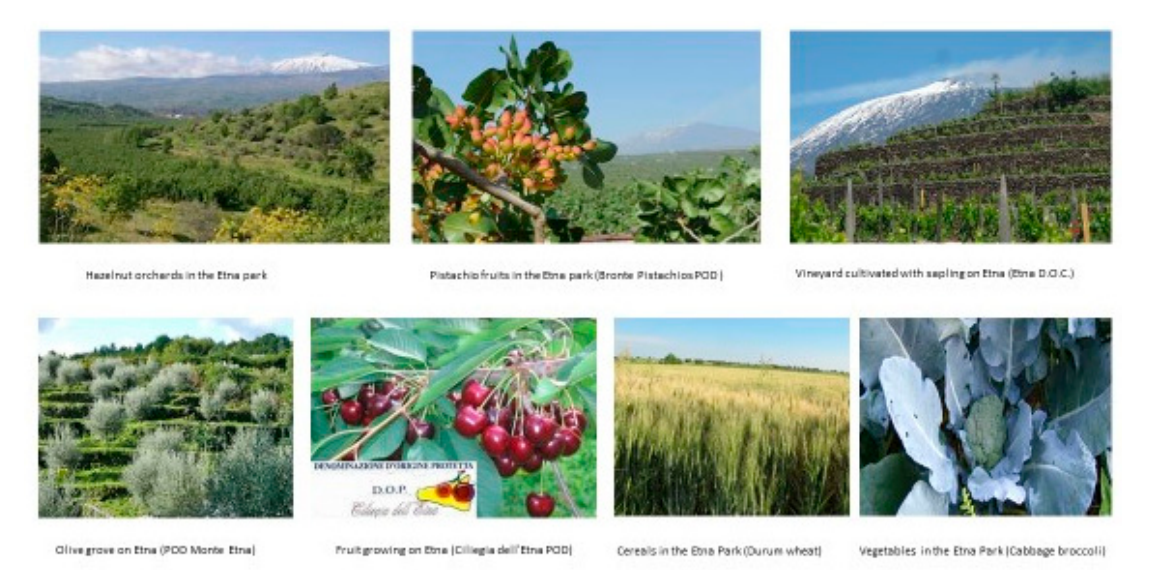
Figure 3. Landscapes and agricultural productions in Etna Park.

The subject area of this research was Etna Park, to which the theory of rough sets was applied, with a view to solving decisional problems related to the choice of crops to be adopted within the protected area (see Figure 3). These decisions need to be compatible with the maintenance of the ecosystem balance, which has been altered to an extent due to the increase in human activity.