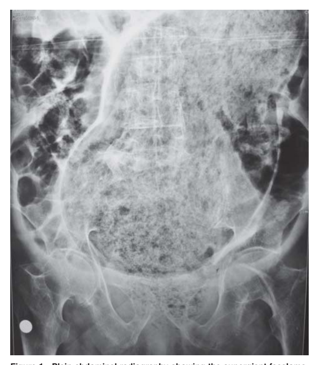
Figure 1 - Plain abdominal radiography showing the supergiant fecaloma.