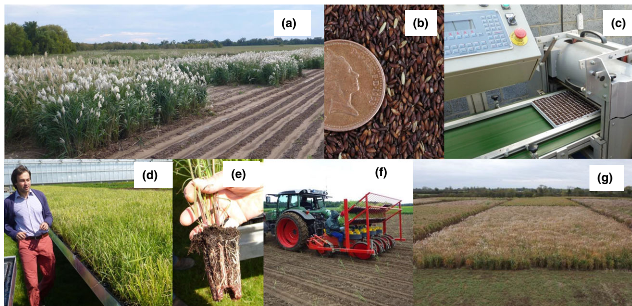
Fig. 1 Steps taken to develop seed-based Miscanthus hybrids: (a) Field seed production trials in CERES, USA. (b) Threshed Miscanthus sinensis seed with a British pound coin for scale. (c) High throughput plug sowing. (d) Dr. Michal Mos, checking plugs which are hardening for field planting in Lincoln. (e) A field-ready plug. (f) Mechanical planting of plugs with a Unitrium plug planter in Stuttgart, Germany. (g) Large-scale replicated 0.25 ha plot trials in Lincoln, UK.

The chances of seedling establishment in the temperate zones can be improved by covering the seed bed after sowing with photodegradable transparent polymer mulch films, as is used for maize (Keane et al. , 2003). These film coverings create conditions conducive to