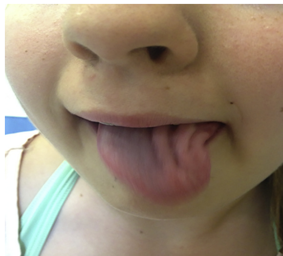
Fig. 2 – The present patient, at admission (10 years of age). The tongue is markedly deviated to the left as a consequence of left HNP.

The electromyography (EMG) of the genioglossus muscles and the nerve conduction velocity (NCV) of hypoglossal nerves showed a motor axonal neuropathy of the left hypoglossal nerve. In particular, at EMG, a spontaneous activity and positive sharp waves were noticed only in the left genioglossus muscle. At a maximum contraction, the recruitment pattern of the same muscle was markedly reduced. The NCV of the right hypoglossal nerve showed normal distal latency (1.9 milliseconds), and a normal amplitude after mandibular-angle stimulation (2 mV). In the left nerve, latency was normal (1.7 ms), while the amplitude after mandibular-angle stimulation was reduced [0.1 mV (–95%)].