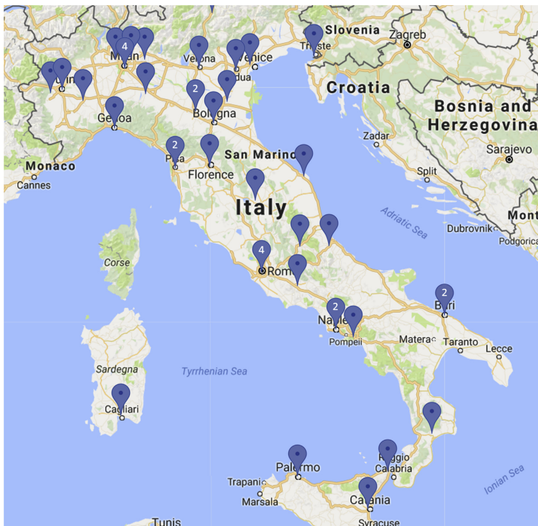
Fig. 1. Map of the location of clinical centers of LIPIGEN Network in Italy.