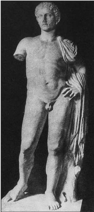
Fig. 7 - Hermes of Atlanta (from a model of Praxitel).

tures typical of the “maniera” of Lysippus and of the Sicyonian school, or Praxiteles, can be observed in the general compositional schemes of the figures and in the rendering of the faces as well (Fig. 7).