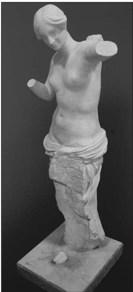
Fig. 3 - Rododune following the model of Aphrodite Anadiomene.

Khanum, also indicate the contemporary existence of different tastes in the everyday production of the local workshops.