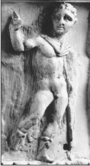
Fig. 6 - Detail of the Rhyton 22 (Hermes).