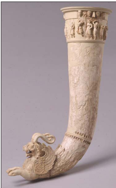
Fig. 5 - Rhyton 43.

that we can call “style”, can carry important cultural-ideological implications, sometimes better detectable than in iconography. The style, in fact, often reflects a more or less conscious choice of sharing a discrete language. This type of choice should originate from precise exigencies, at the base of which there are ideological assumptions of the group commissioning the works of art. Not only iconography, then, but also style is a fundamental indicator of the image the purchaser wants to convey about himself.