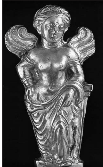
Fig. 11 - So-called “Aphrodite Kushana”.

The suggested eight style-groups differ from one another not only in the rendering of separate figures, but in general, in the formal principles underlying the conception of representation itself. The change of these principles seems to be connected with a formal process at the base of which there must be a difference in the representative exigencies.