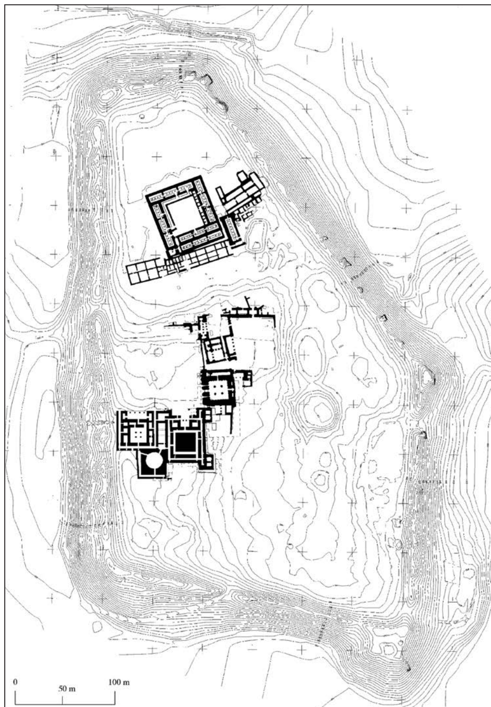
Fig. 2 - General Plan of the site.