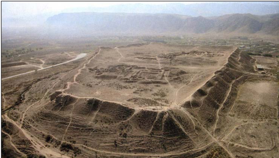
Fig. 1 - General View of Old Nisa.

The Parthian Empire is a very fascinating period of Central Asian History connected both to Greece and Rome as well. Ruling from 247 B.C. to A.D. 228 in the Iranian region, widely coinciding with ancient Persia, the Parthians defeated Alexander the Great's successors, the Seleucids, conquered most of the Middle East and southwest Asia, controlled the Silk Road and transformed Parthia into an Eastern superpower. The general cultural history of The Parthian empire, could be resumed in the dualism between a complex mixture of nomadic substrate, Iranian cultures and the Roman power at the West.