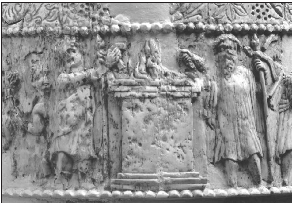
Fig. 9 - Rhyton 8 (detail).

Unfortunately, the state of preservation of this specimen doesn't allow appreciating the sequence of the figures. It is, in any case, possible to catch some sort of codification of the representational principles already experimented in the previous group. The number of the frontal characters is increased. The succession of the two types of representation in space seems now definitively to be an obstacle to the effect of the narrow scene.