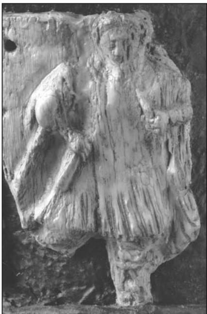
Fig. 8 - Rhyton 78 (detail).

The figure at the altar on rhyton no. 8 (Fig. 9), as well as the characters frontally represented on rhyton no. 78, of the same group (the tambourine girl, the double flute player, the thyrsus bearer), all answer these principles.