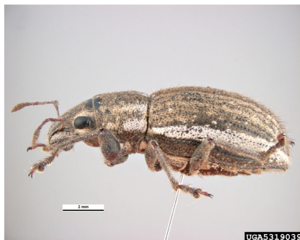
Figure 1: Naupactus leucoloma

Yes. The identity of Naupactus leucoloma Boheman is established.