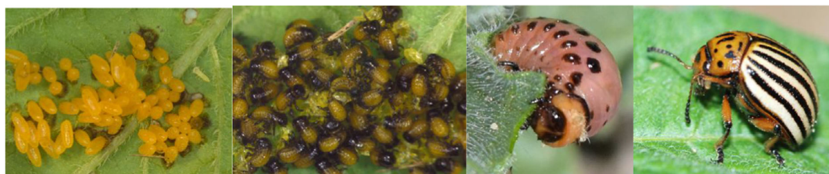
Figure 1: Leptinotarsa decemlineata , from left to right: egg batch (MJ Hatfield, Bugguide.net), newly hatched larvae (MJ Hatfield, Bugguide.net), 4th instar larva (Steven Mlodinov, Bugguide.net), adult female (Lynn Bergen, Bugguide.net)

A diagnostic protocol designed for use in Australia is available (Australian Government, 2018).