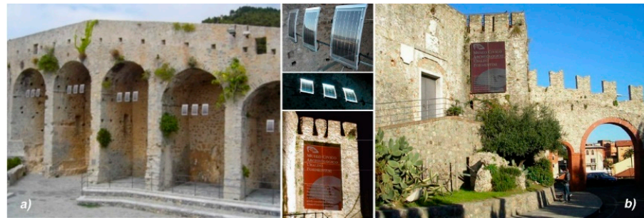
Figure 2. Installations of Renewable Energy Sources (RES) systems on heritage buildings. (a) Self-illuminating “Solar flags” on the Doria Castle in Porto Venere (Italy); (b) Display board in the façade of the La Spezia Archaeological Museum (Italy) [75].

To date, the installation of RES systems in the historic Italian centres, as elsewhere, remains the main problem to be overcome, to really improve the energy sustainability of the cities [76]. The building’s previous function, layout, and interaction with the environment create multiple constraints, which impact any new use of the building [15,77].