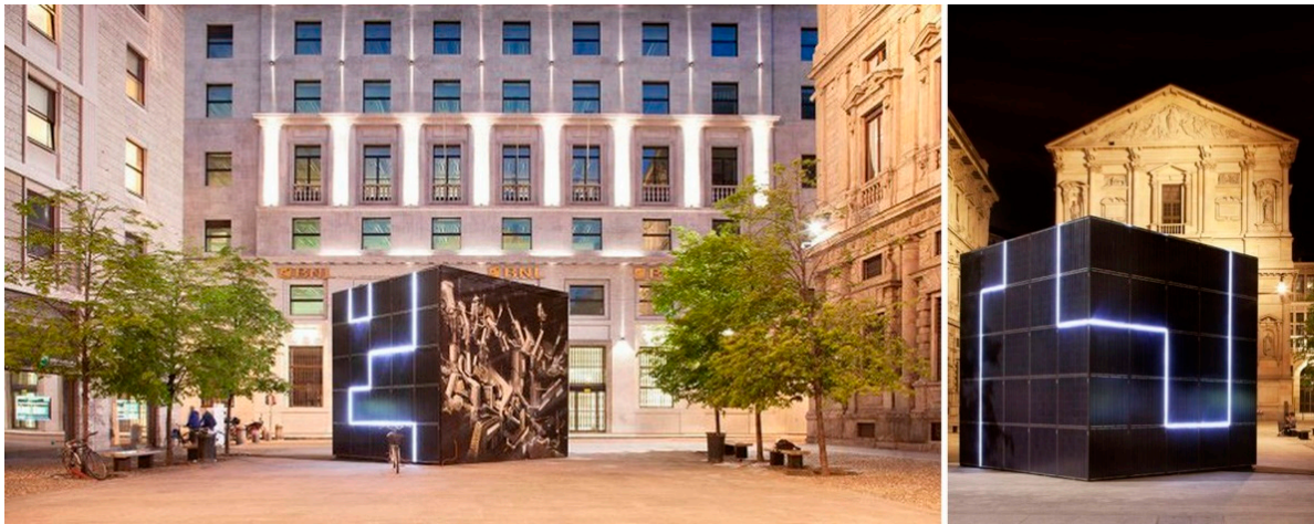
Figure 5. Public installation e-QBO, a photovoltaic (PV) cube designed by the architect Romolo Stanco. E-QBO functions as a photovoltaic accumulator and communication hub [110].