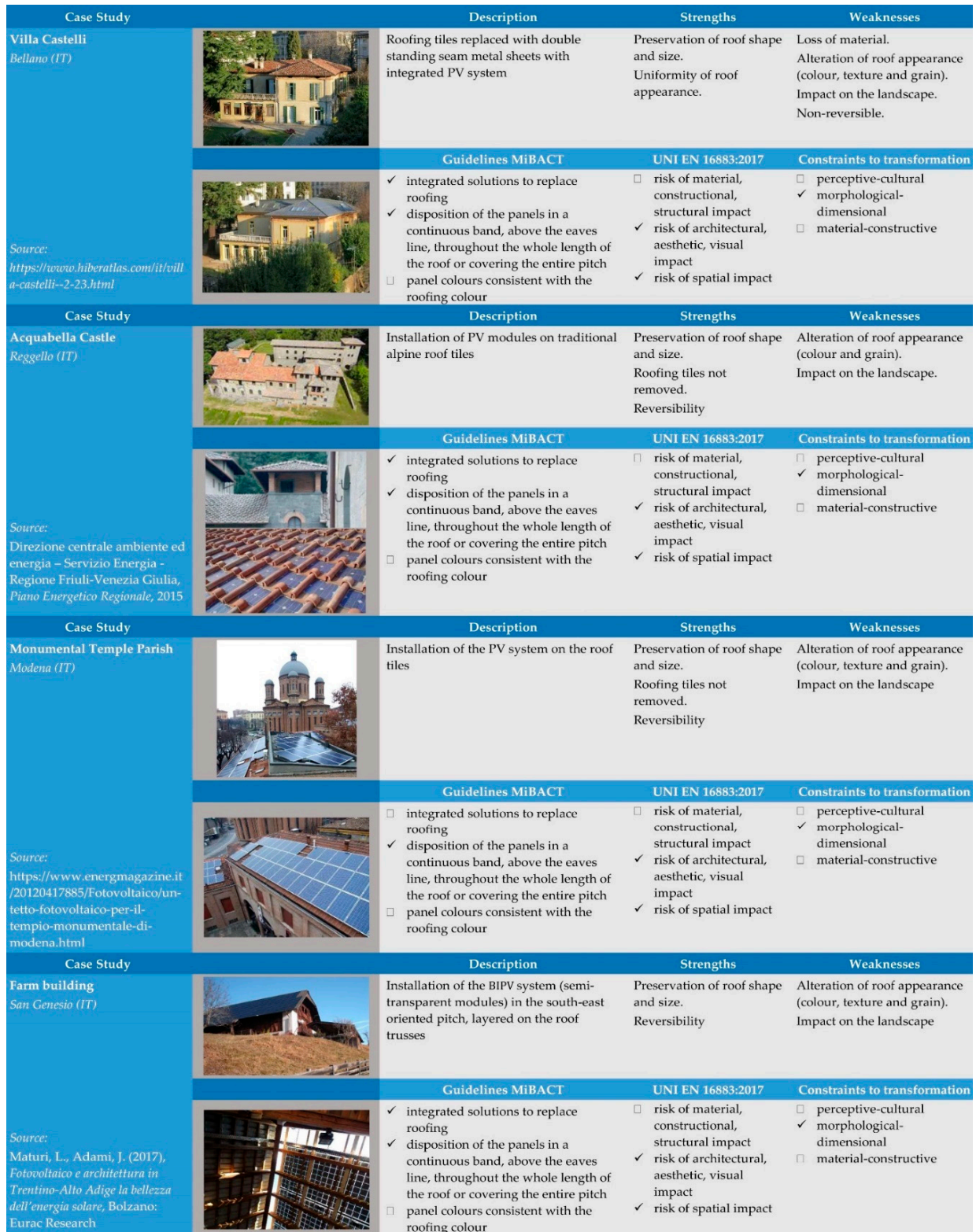
Figure 3. Analysis of study cases.

The results of the analysis are summarized in Figure 3.