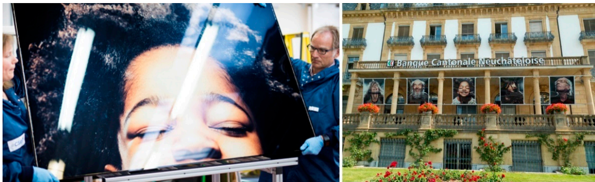
Figure 6. KALEO exhibition taking place in the BCN gardens in Neuchâtel. The exhibition features panels with portraits by Swiss photographer Guillaume Perret, showing facial expressions of people who radiate energy, and one by student Etienne Wildi, winner of the KALEO competition [111,112].