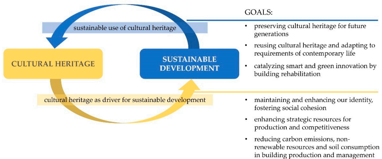
Figure 1. Outcomes of the cultural and economic framework. The dual perspectives in the relationship between cultural heritage and sustainable development.