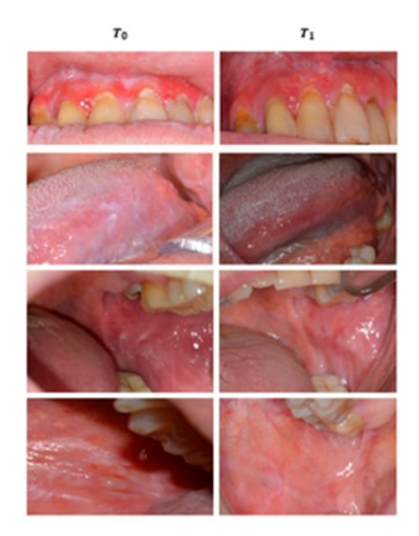
Figure 2. Intra-oral photos of some of the subjects who joined the clinical trial at T0 and T1. The action of the drug on the lesions can be seen after 12 weeks of treatment (Clobetasol group).

improvement in symptomatology. In the anti-inflammatory group, 17 out of 20 patients treated (85%) showed a reduction in symptoms, of which one patient reported a total absence of symptoms (NRS = 0); 12 patients reported mild symptoms (an NRS score between 1 to 3) and three patients moderate symptoms (an NRS points between 4 to 6). Only three patients (15%) found no remission of symptoms.