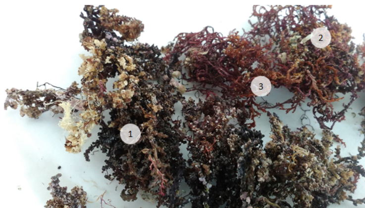
Figure 1. Mixture of the red algae, which includes Palisada tenerrima (1), Laurencia intricata (2), and Laurencia spp. (3), collected on the rocks in the intertidal zone from Favignana island (the Egadi Islands, Sicily, Italy).

structures, ultrastructure of chloroplasts, storage compounds, etcetera. Red algae are known not only for their use in food and cosmetic productions [20], but also for their numerous biological activities, including anticancer [21], antidiarrheal [22], antimicrobial and anthelmintic activities [17,22–24]. The latter activity has been known since ancient times in Eastern countries and around the Mediterranean area including Italy, where red algae were used as an anthelmintic in popular medicine [25,26].