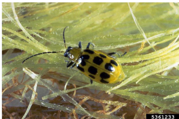
Figure 1: Adult Diabrotica undecimpunctata howardi .