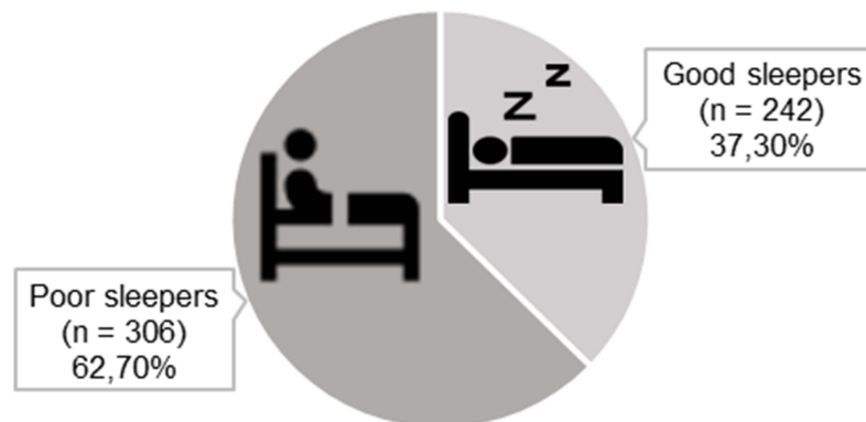
Figure 2 Percentages of poor sleepers and good sleepers during the T1 and the T2 assessments.

Notes: A Sleep Index II score >25.8 was categorized as Poor sleeper; A Sleep Index II score <25.8 was categorized as Good sleeper. The icons are selected from the https://icons8.com/icon/105962/subire-l'insonnia and https://icons8.com/icon/10787/dormire-nel-letto .