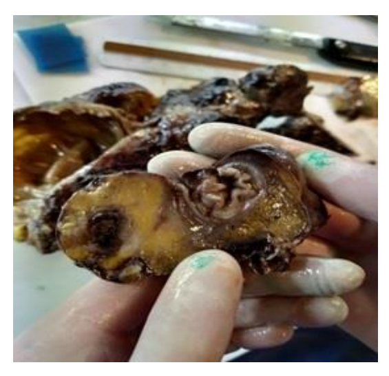
Figure 2. Histological confirmed ileal diverticulum with mucosal ulceration and inflammatory lesions suggestive of perforated diverticulitis

Histology confirmed ileal diverticulum with mucosal ulceration and inflammatory lesions suggestive of perforated diverticulitis (Figure 2). His recovery was uneventful, with a prompt resumption of oral nutrition and normal alvus. He was discharged on postoperative day 7 and presently in the surgical clinic follow up. The patient made a full recovery.