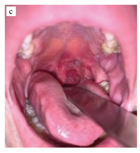
FIG 1 a-c. Ulceration with a raised edge over the left palatine tonsillar region with surrounding erythema (a). Seborrheic dermatitis-like skin lesions over the limbs and torso (b). The posttreatment clinical image of the left palatine tonsillar region at the end of the 1-month follow-up (c).