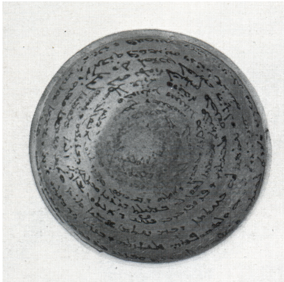
Figure 1. Reworked image from Christie's (1973)

The sequence [hd]yn [ḥtm]t[ʔ] is reconstructed upon the parallel one in no. 48: 6 (Moriggi 2014: 206). Here the demonstrative pronoun masculine singular ( hdyn ) is used with reference to a substantive feminine singular in the emphatic state ( ḥtm '). This phenomenon occurs also in the parallel text no. 48: 6 and in some other instances in Syriac incantation bowls, possibly anticipating the neutralisation of gender opposition in demonstrative pronouns as attested in North-eastern Neo-Aramaic. 11