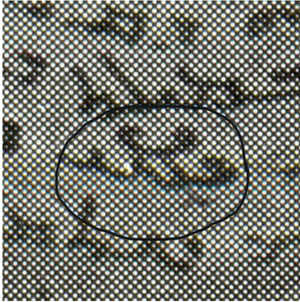
Figure 2. Reworked image from Christie's (1973)