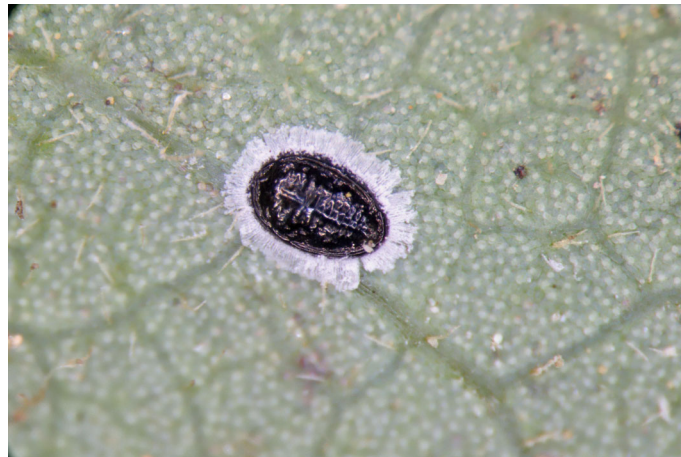
Figure 1: Tetraleurodes perseae pupa, showing the dark pupa with marginal white wax fringe which are characteristic for many of the species in the Tetraleurodes genus